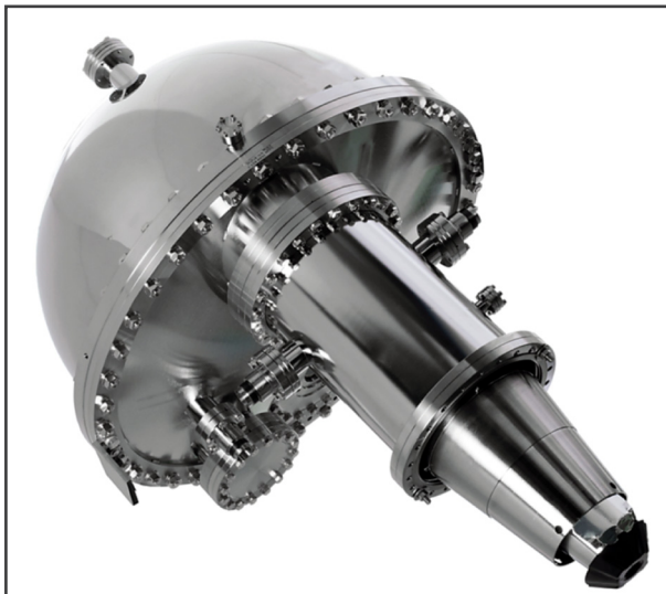
From the Electron Spectrometer Pioneers: The DA30-L Angle Resolved Electron Spectrometer.