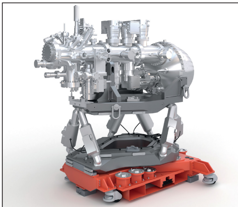
Figure 1: The Scientia Omicron Bar XPS design was developed by Anders Nilsson and Peter Amann at Stockholm University. Bar XPS uses the virtual gas cell design, which creates a high local pressure area around the sample of > 1 bar (a), (b) shows a Rh 3d spectra recorded at 2 bar He pressure. Left: a schematic figure of the system.