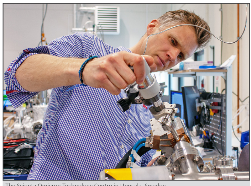
The Scienta Omicron Technology Centre in Uppsala, Sweden.