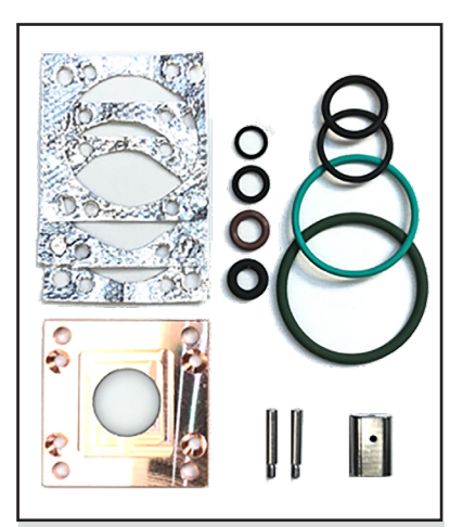
High Uptime Kit for the VUV5k

The Scienta Omicron High Uptime Kit for the VUV5k includes the most common spare parts needed to perform a fast onsite repair for the instrument. With this kit available at hand, downtime of the instrument can be reduced to a minimum and interruptions to operations can be avoided. Read more about the inclusion of this package on the next page. If you have any questions, please contact our Services Team.